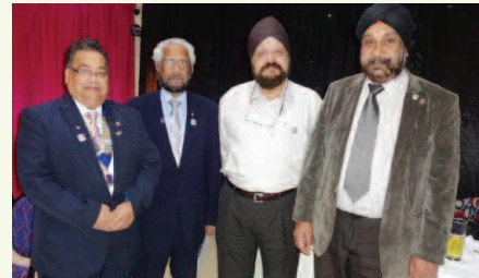
Welcome to 2 new LC of Ealing members