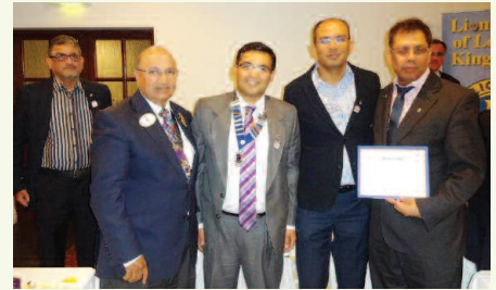
Welcome to new member