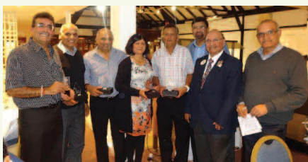
Golf day winners