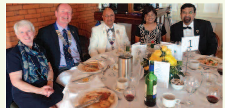
Luncheon at CA of LC of Amersham and Chesham