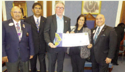
Presentation to Alzheimer's

worked hard to make it a successful event. Congratulations to the winners. I also thank all those who sponsored the event and help raise over £3000 for Charity for Children with Special Needs.