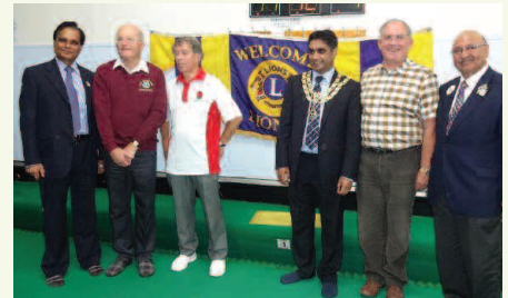
Blind Bowling Fun Day

Try Blind Bowling!! Fun day organised by LC of High Wycombe for the blind at Handy Cross indoor Bowls rink to celebrate LCI world sight day. 15.10.14.