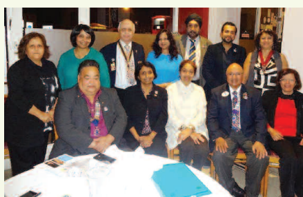
Meeting with LC of Park Royal 6.10.14