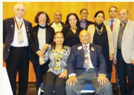
Meeting with LC of London Central 2.10.14

I was very happy to induct 2 new members at LC of Ealing on 1.10.14