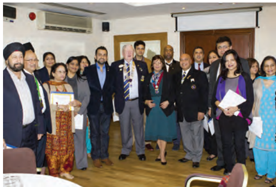
Lions Club of Park Royal formation