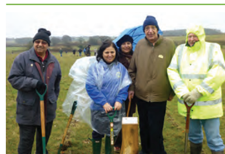
Tree Planting on a Spring (!!) day