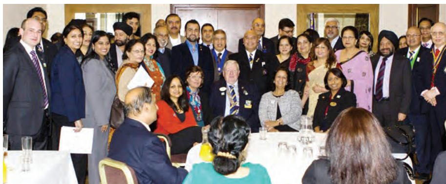
Members and guest at Park Royal formation