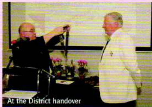
At the District handover