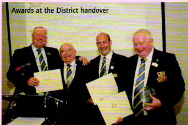
Awards at the District handover

I said at the beginning of the year that I wanted to improve the communications between District and members. Shortly, club secretaries will be asking everyone if they would like direct mailing of links to articles on the website, similar to the MD wordpress. So every time a new article appears on the website which will be updated on a regular basis, you are then immediately up to date.