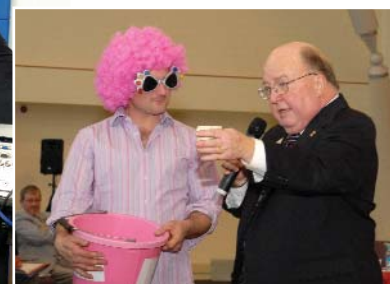
Prize giving and International guest