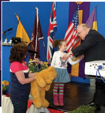
Fun for all at the Convention