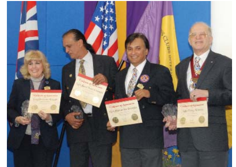
More happy award winners.