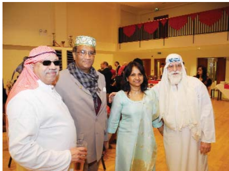
Dressed up for the pre-convention night