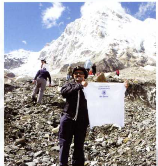
Lions Club of Sudbury

With your kind support they all made it... A journey to remember and cherish forever.